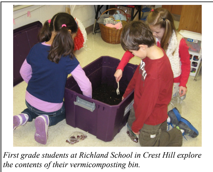
First grade students at Richland School in Crest Hill explore the contents of their vermicomposting bin.

We plan to offer this program again to schools during the 2013-2014 school year. Check willcounty-green.com in September for information to get your students actively involved in composting.