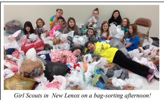
Girl Scouts in New Lenox on a bag-sorting afternoon!

The challenge is scheduled to end on Earth Day, April 22. As of the end of February, the schools had collected over 450,000 bags. Check back with us to learn which school won the recycled plastic bench.